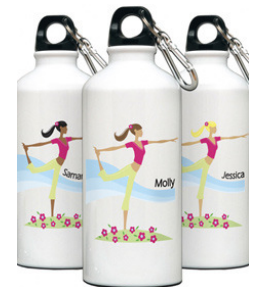
Personalized Water Bottle

Note: Images may not match exact examples shown.