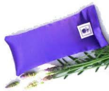
Lavender Eye Pillow